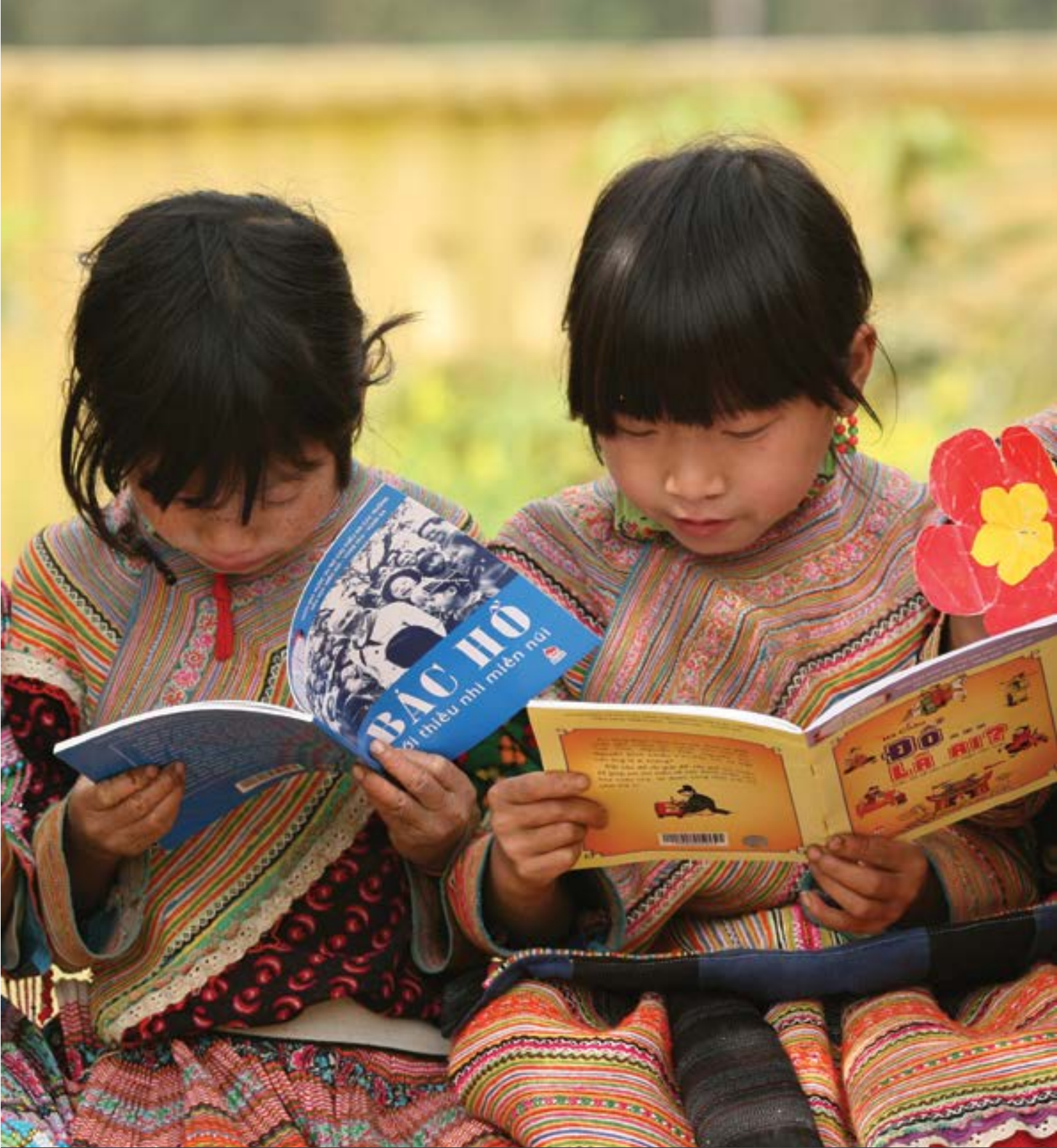
Girls from an indigenous community read outdoors at Ban Pho Primary School in Bac Han District in remote Lao Cai Province, Vietnam.