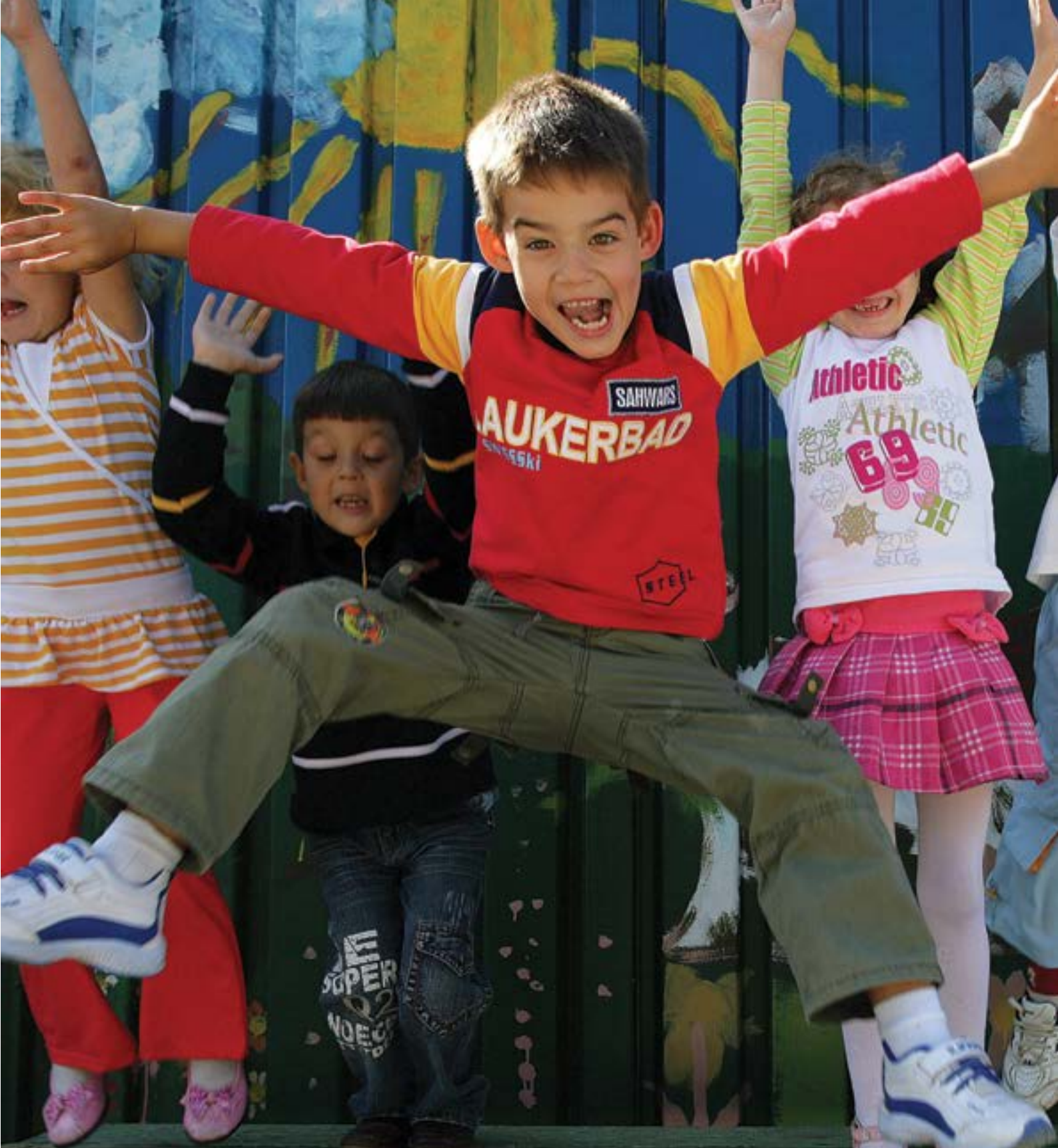
In 2007 in Romania, children jump in a playground in Bucharest, the capital.