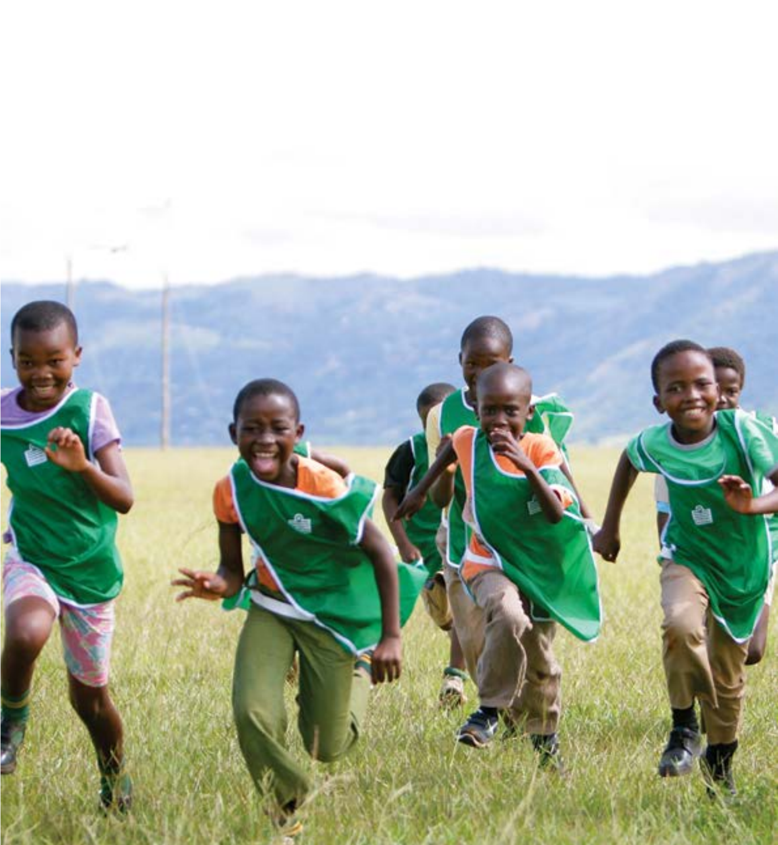
Children play in the town of Lobamba in Lobamba Region, Swaziland.